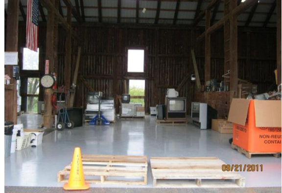
The electronic collection area, after the construction of our new storage building.