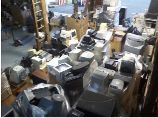
Electronics were previously stored within the collection area.