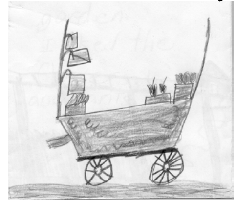
Drawing by David of Birdsboro Elementary