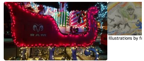
Reader photos from Christmas at FirstEnergy Stadium