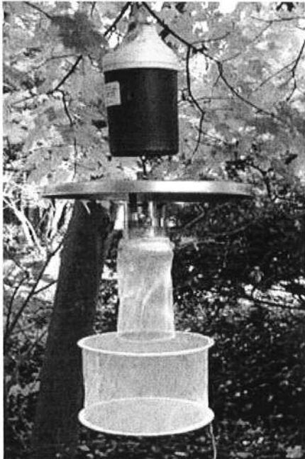
Mosquito Light Trap