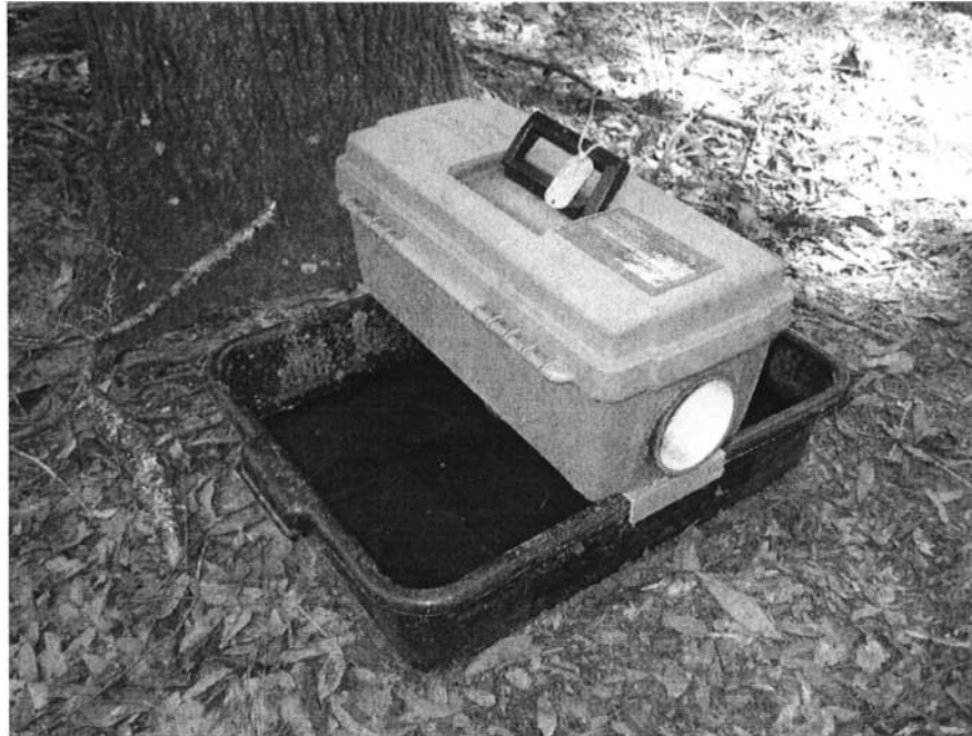
Mosquito Gravid Trap