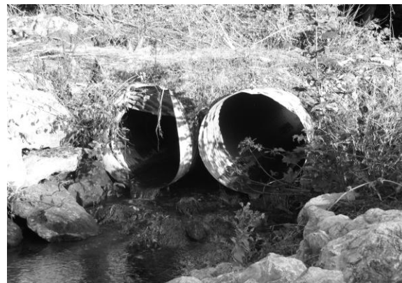
Photo shows the two metal pipes to be removed.

The Governor Mifflin Area Coordinating Council (GMACC) consisting of Brecknock and Cumru Townships and the Boroughs of Kenhorst, Mohnton and Shillington, as well as the Governor Mifflin School District, selected a project located in Kenhorst as their 2013 joint activity. The project was completed on August 14 th and consisted of removing two, 10-foot long corrugated metal pipes from a 15-foot stormwater utility easement which runs parallel to High Boulevard from Commonwealth to the Angelica Creek. The project was selected to reduce flooding during heavy rainfall events. Some excavation was required to enhance the flow of stormwater after removal of the two pipes. Large boulders were placed along the banks to stabilize the area.