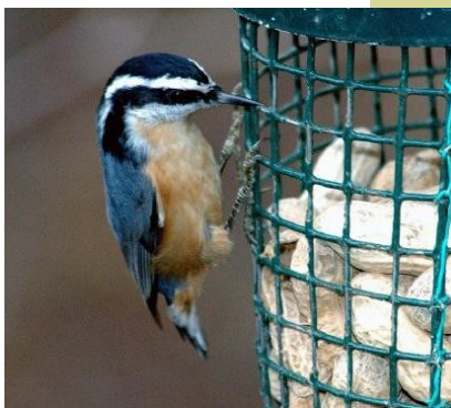
Will you see a Red-breasted Nuthatch this year?

Ongoing —Birdseed Shed at Honey Hollow Env. Ed Center, Bucks County Audubon BCAS.org