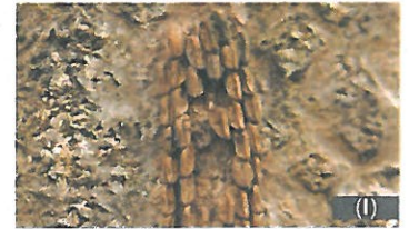
(A) Spotted lanternfly adult showing the forewings and hind wings (B) Adults at rest on bark (C) Lateral view of an adult (D) 1st instar nymph (E) 4th instar nymph (F) Adult feeding on wild grape, Vitis sp. (G) Weeping sap trail on bark (H) Egg mass (oothecum) covered in coating (I) Old hatched egg mass on tree trunk.