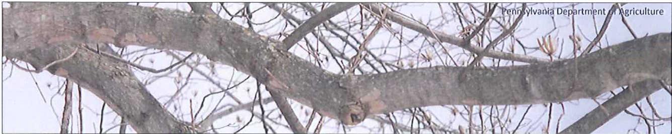
Branch with spotted lanternfly egg masses